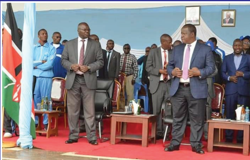
Interior and coordination Cabinet Secretary Fred Matiang'i at the official opening of the 10th Edition of Wasco games.

Nyeri Water and Sanitation Company is the reigning NRW Champions in the country. This is according to the Ministry of Water and Sanitation report on Non-Revenue Water Management 2017/2018.