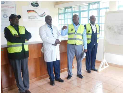
Directors during the inspection tour of the company's facilities