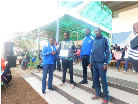
10000m second runners up