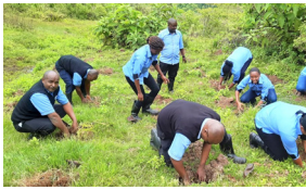
Senior Management planting trees

It is our commitment to plant over a million seedlings annually as well as distribute another 1 million seedlings to other stakeholders in an effort to realize the recommended 10% cover.