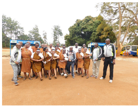
Cultural dancers share a light moment with members of the management team