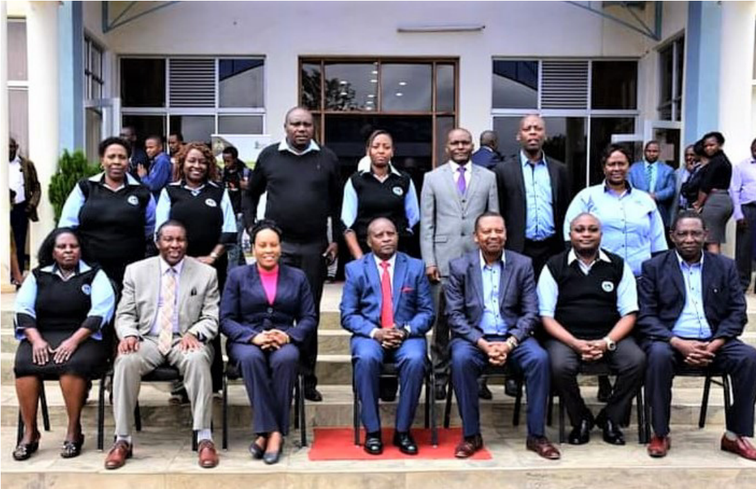
NYEWASCO Directors at KSG Embu.