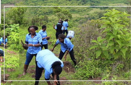
Young Professionals planting trees