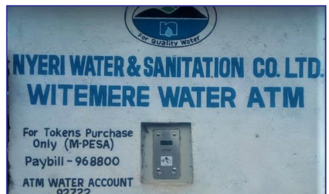
Witemere Water ATM