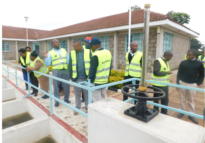
Inspection tour of the company's facilities