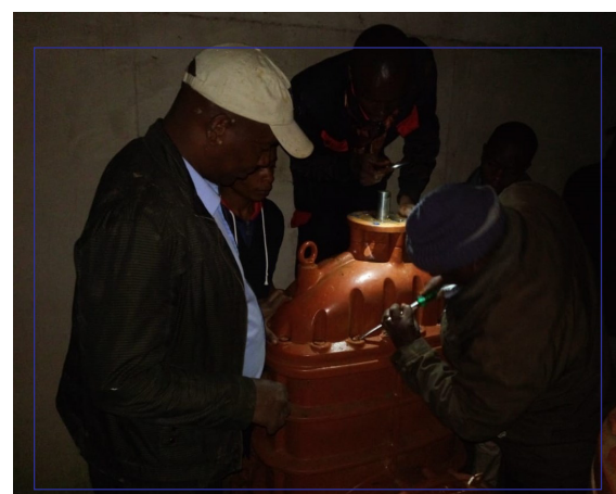
The Technical team burning the midnight oil to ensure supply resumes after cleaning the clear water tank

However, it was restored immediately thereafter.