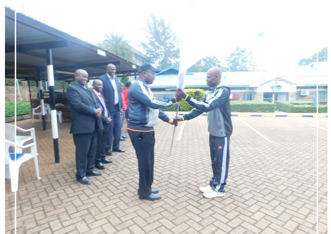
The MD handing over the company's flag to the team commander during the flagging off ceremony

Nyeri Water and Sanitation Company is the reigning NRW champions according to the recently released Ministry of Water and Sanitation Non-Revenue Water Management Annual Report 2017/2018 having the least NRW ratio in the country.