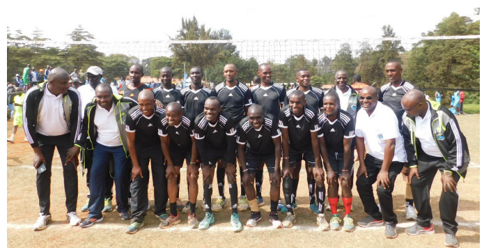
Volleyball men team. Position 3 overall at WASCO 2019