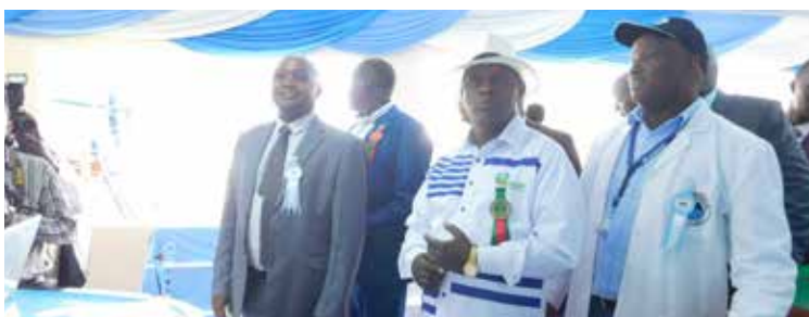
Nyeri County governor H.E Hon. Mutahi Kahiga at the ASK Show and Trade fair Central Region Edition.