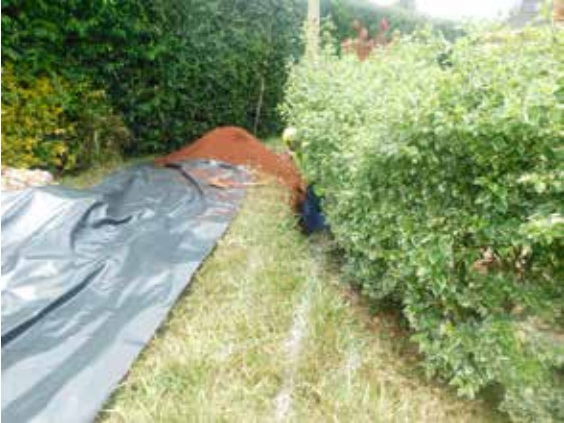
OB sewer connections

Dear Customer, Do you want to connect to our sewer line but you are worried we will mess up your compound? Worry no more. We will reinstate it and leave it as we found it or even better! what's more, we care for your plants and flowers too!