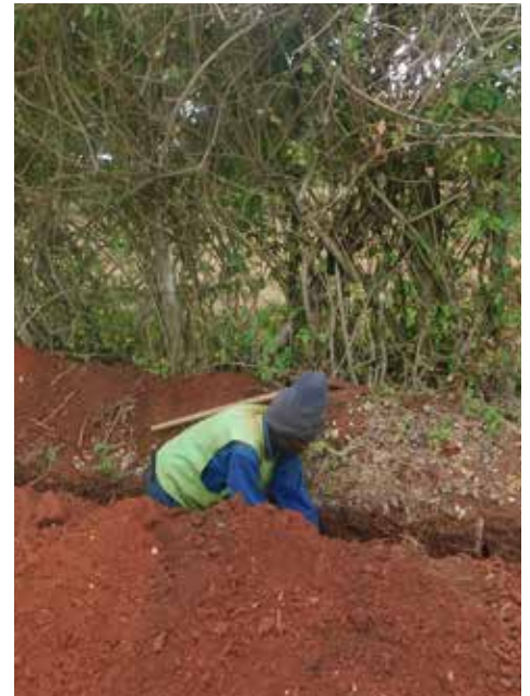
Excavation for laying new pipes