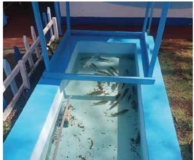
NYEWASCO stand at the National ASK Show, Central Region at Kabiruini grounds in Nyeri