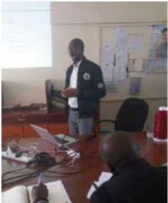
An official from WASREB elaborates the use of MajiVoice to staff

MajiVoice to enhance customer engagement and complaints resolution.