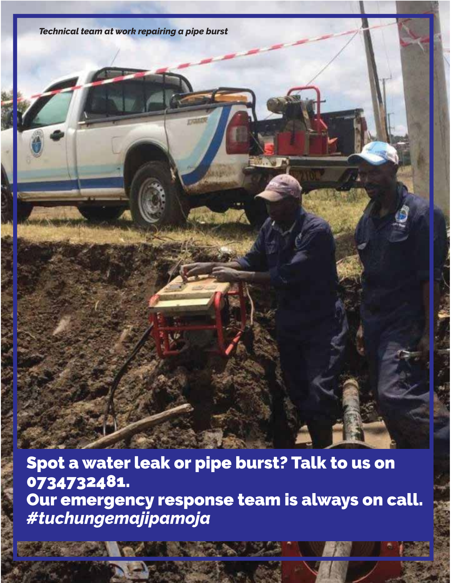
Technical team at work repairing a pipe burst

Spot a water leak or pipe burst? Talk to us on 0734732481. Our emergency response team is always on call. #tuchungemajipamoja