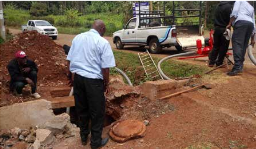
Technical team at work repairing a pipe burst