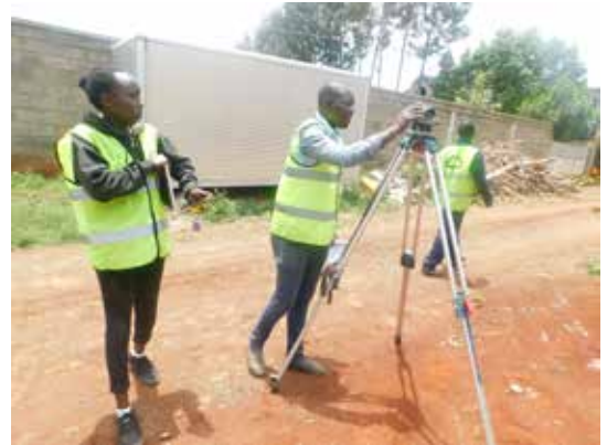
Mapping of a Customer's compound for sewer connection