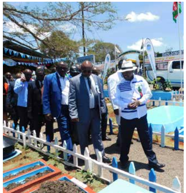
Nyeri County Governor H.E Hon. Mutahi Kahiga Inspect the NYEWASCO stand.