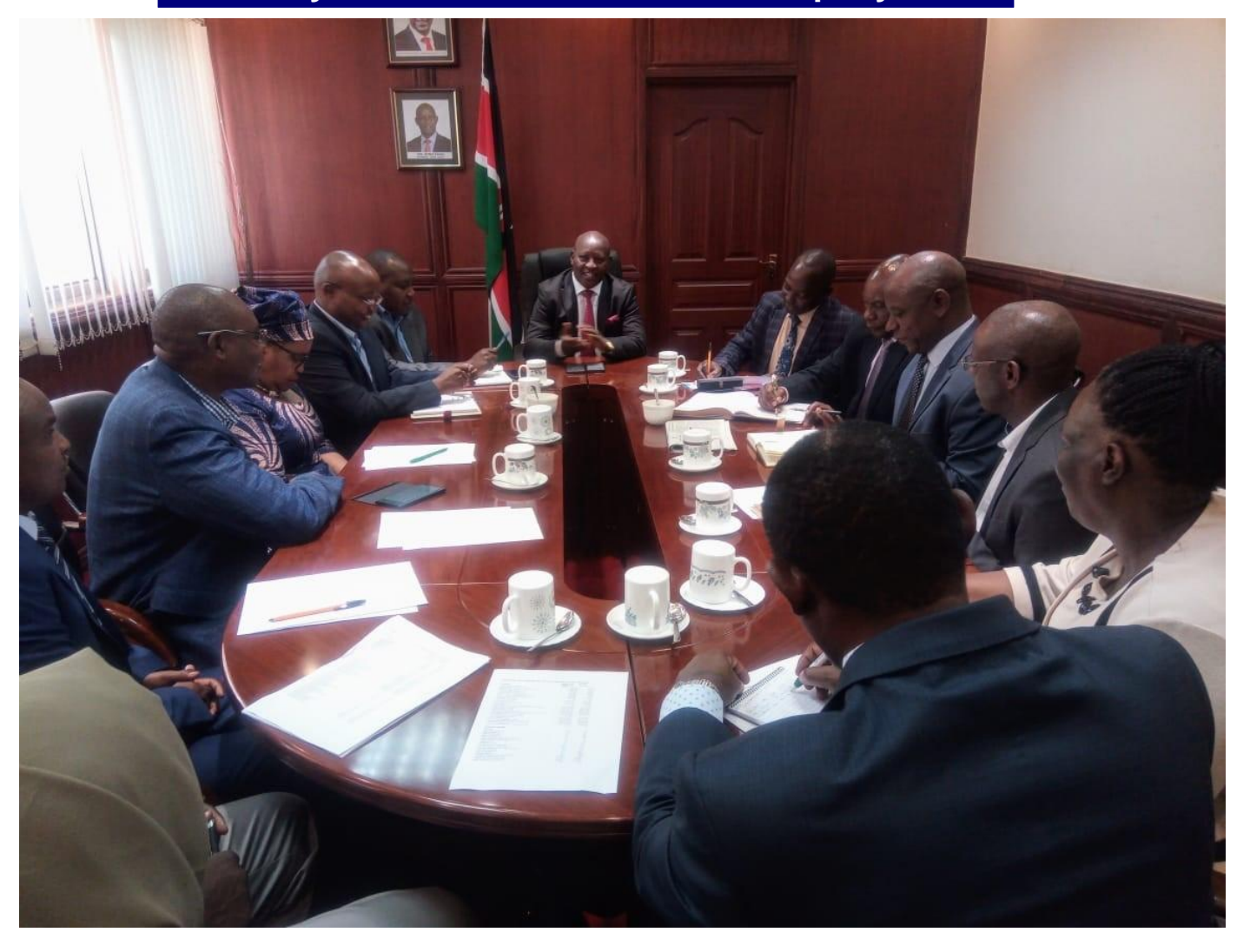
WASREB BOD courtesy call to H.E Hon. Mutahi Kahiga