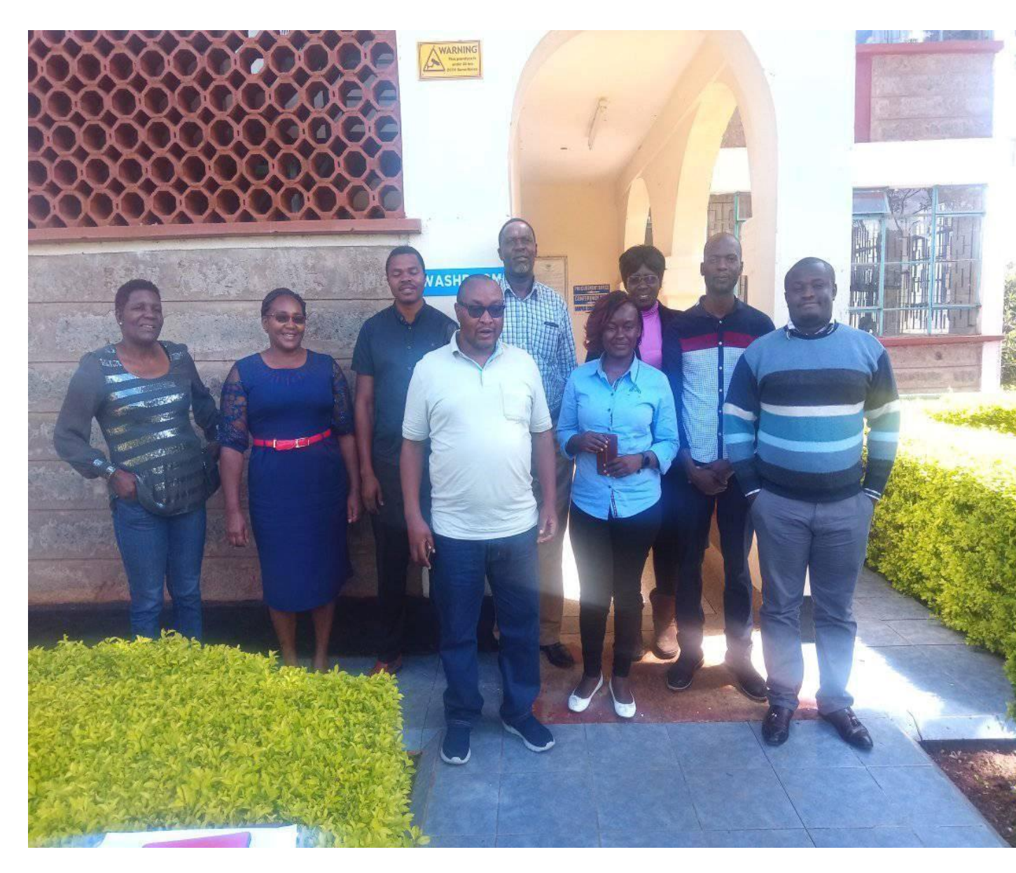
Members of the HIV/AIDS committee (Nairobi Water) during the benchmarking mission

Human Resource is the back bone of every organization. The company hosted The HIV/Aids Committee members from Nairobi Water on when they paid us a courtesy visit to learn more about our HIV/Aids policy at the work place. NYEWASCO acknowledges the seriousness of the HIV and AIDS pandemic and the significant impact of the same in the place of work. Thus, the company has a HIV & AIDS workplace policy which is instrumental in helping to prevent the spread of the epidemic, mitigate its impact on workers and their families and provide social support to help them cope with the disease. It covers key principles such as the recognition of HIV /AIDS as a workplace issue, prevention, non-discrimination in employment, gender equality, screening and confidentiality, care and support as the basis for addressing the epidemic in the workplace. Other companies in the water sector are alive to this fact and our counterparts from Nairobi Water paid us a courtesy call to benchmark on the effectiveness of the policy as they work on their own. During the visit, the committee were informed of the purpose, objective and scope of the policy among other aspects. They enjoyed a highly interactive session with members of the HIV/AIDS committee of NYEWASCO.