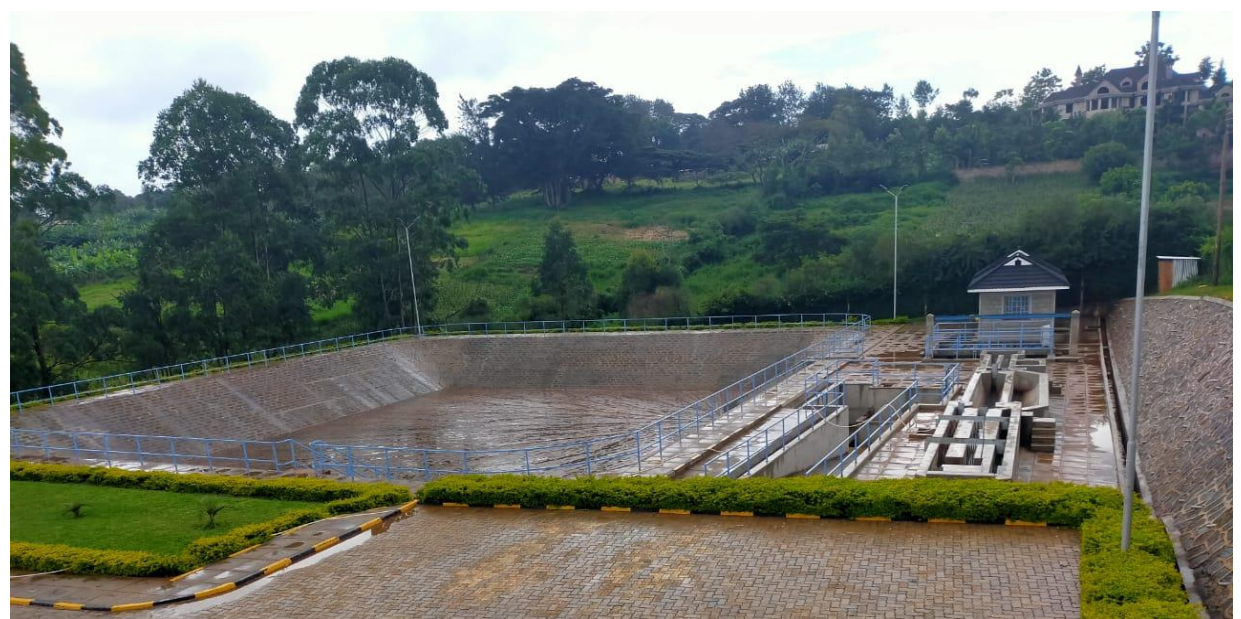
The new and operational King'ong'o Pumping Station