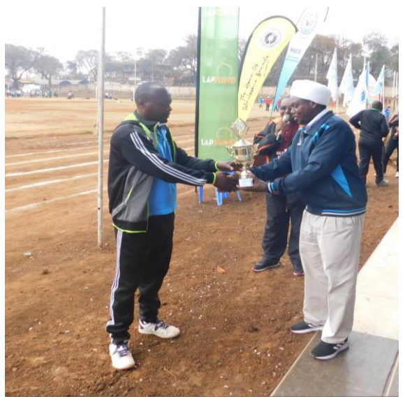
ASK SHOW 2019 CENTRAL REGION