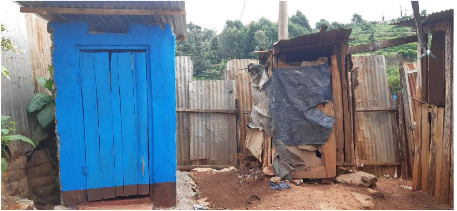
UBSUB upgraded toilet in comparison to the previously used shack