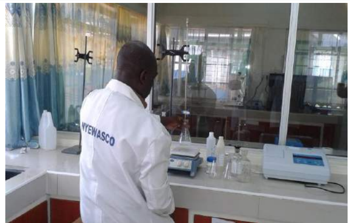
ISO accredited lab at Kamakwa