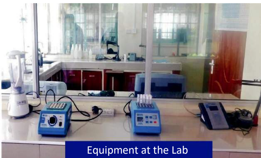
Equipment at the Lab