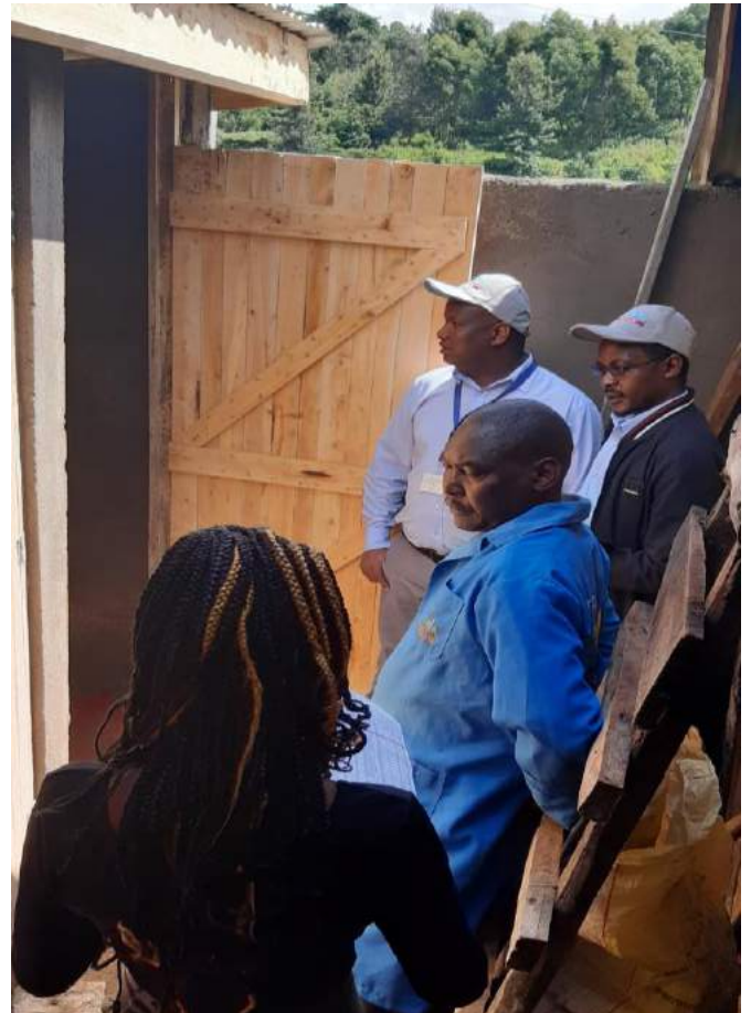
Toilet construction appraisal process