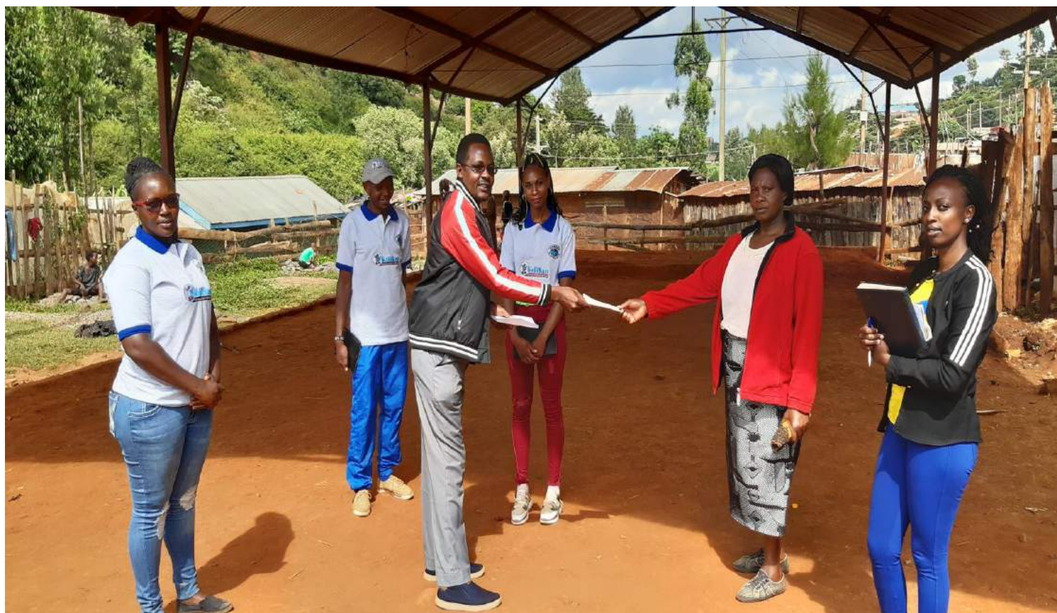
Cheque handing over ceremony at Witemere