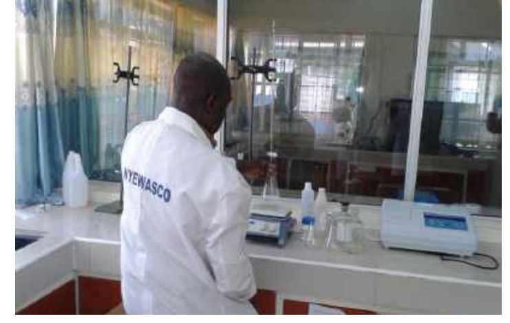
ISO accredited lab at Kamakwa

Our staffs are highly trained and accurate results are quaranteed.