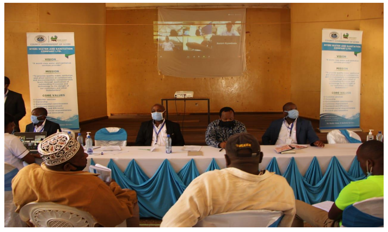
Nyeri town Member of Parliament following the discussions during the Public Consultative meeting on Tariff review at YMCA Nyeri town which was held on 9<sup>th</sup> October 2020.