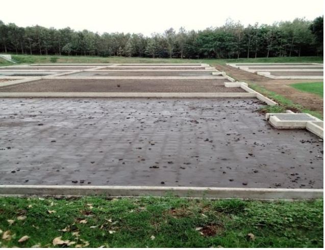
Fig1. Backwashing the Humus Tank at Kangemi T WorksFig2. Backwashing the sludge beds at Kangemi T WorksFig3/4 Washroom construction at the Kangemi T Works near the fish ponds.Fig5/6 Ongoing construction of an incinerator at the King'ong'o Sewer Pumping Station.