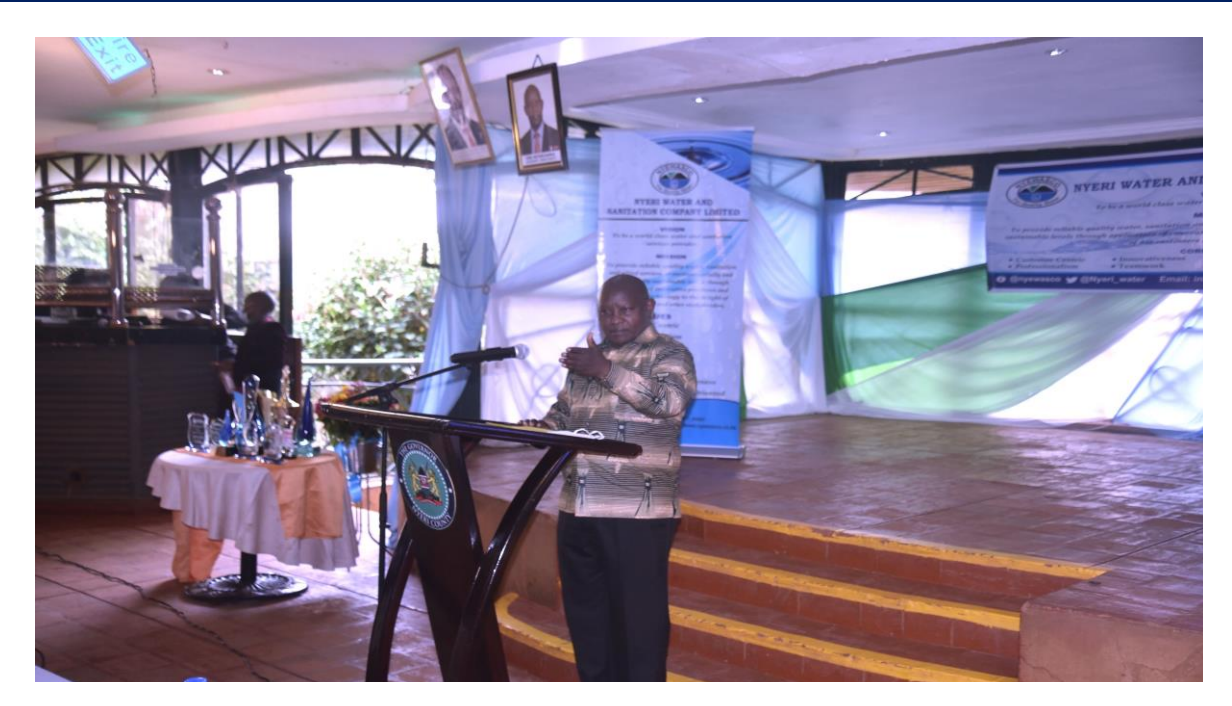
H.E HON. Mutahi Kahiga, Governor, County Government of Nyeri giving a speech during the Strategic Plan launch