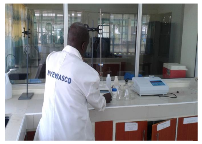
NYEWASCO ISO/IEC 17025:2017 Accredited Lab

Nyeri Water and Sanitation Company testing and calibration laboratories are among the first laboratories to have undergone the stringent assessment and successfully transited to the new ISO/IEC 17025: 2017 Standard accreditation in Kenya. This gives increased confidence on the accuracy and reliability of the results issued from the laboratories for the period Jan 2020-November 2024.