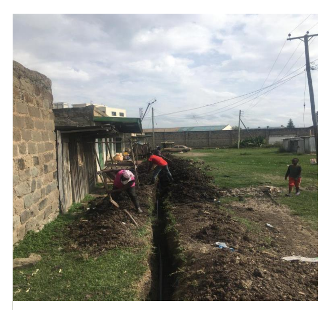
Upgrading Old Chaka water distribution system

A water distribution network upgrade exercise has been completed in old Chaka. This was done in a bid to upgrade the system by replacing old dilapidated PVC pipes to new HDPE pipes which are handier and have less joints hence decreasing the probability of losing water through leakages. This was aimed at increasing the amount of water reaching our customers and it is a big contributing factor to decreasing the level of Non-Revenue Water. Non-Revenue Water. Water is a limited resource. The company undertakes supply network upgrades from time to time to contain these losses.