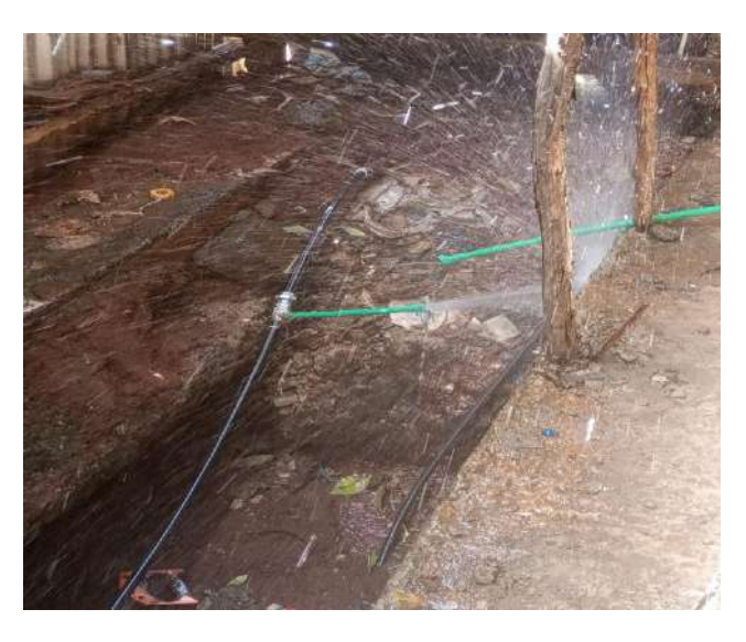
Examples of illegal water connections nabbed by the Security and Investigations section during the month of January 2022