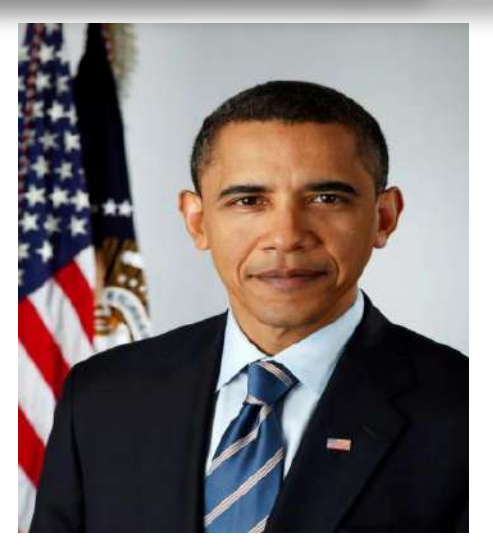
Former US President Barrack Obama (2008, 12)

Failure is one of life's major impediment that we cannot avoid. It happens every time and it can happen in the most unexpected occasions that is, even when we are very prepared for a win. In this dire moments, we have an option of either to give up or to look at the brighter side and keep moving forward." Life is not about how hard you are hit but how hard you can get hit and keep moving forward".