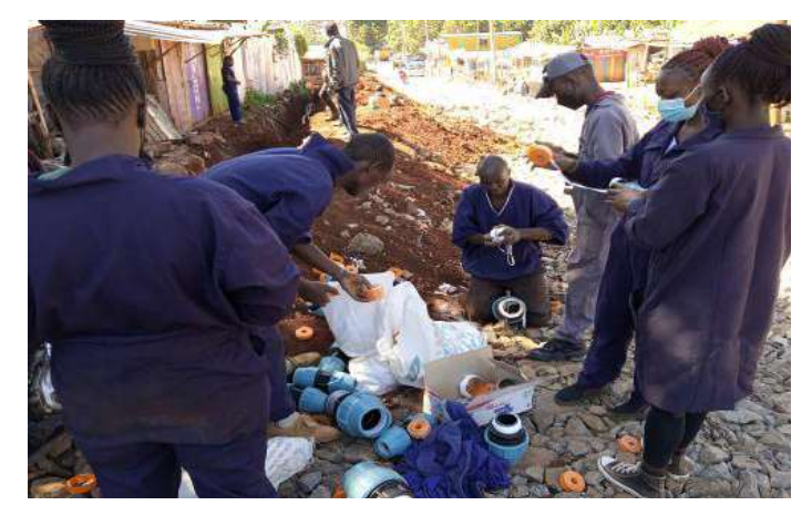
Re-alignment works in King'ong'o service area