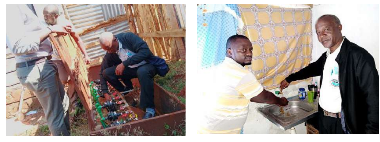
An over joyed customer with NYEWASCO staff after getting a water connection in Skuta

NYEWASCO has invested in a number of resources so as to fulfill her promise on being customer centric and allow access to safe and sustainable water and sanitation services to all residents in her service area. Access to responsive and reliable services provided in a professional manner is a strategic priority in the company's strategic plan for the planning period 2021- 2016. To achieve this, NYEWASCO is expanding water distribution network and sewer connections and sustaining water quality standards. New water connections have been achieved in various places including Skuta, in the month of March 2022 thus making access to potable water a reality to many more customers. The company is committed to playing its role in attainment of the United Nations Sustainable Development Goals, Vision 2030 and the County Integrated Development Plan and her Strategic Objectives which are paramount to the success of the Company in the attainment of sustainable provision of water, sanitation and allied services.