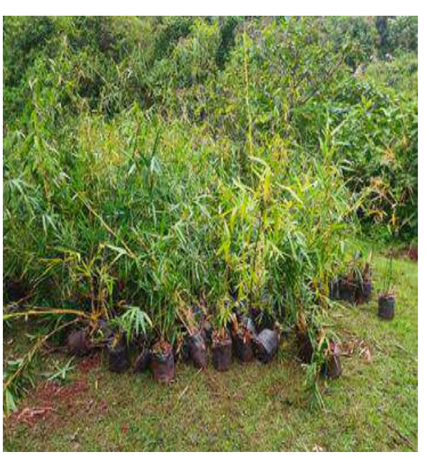
Bamboo seedlings ready for planting