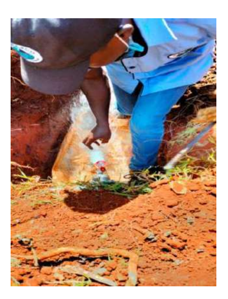
New water connection project in Mweiga