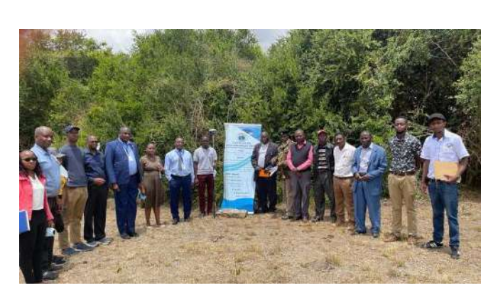
Implementation of The Karichen water project kicks off

Off Kenyatta Road, Behind Nyeri County Fire Offices, P.O. Box 1520-10100 Nyeri Kenya Tel 061-2034548/4623/4622/4617/ 0722-461359/0734-732481: Fax 2032734 - Email info@nyewasco.co.ke - Website www.nyewasco.co.ke