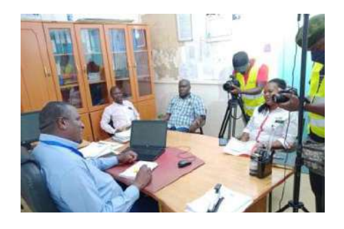
Vision 2030 inspection exercise by the Social pillar secretariat at Kamakwa Water Works and Kangemi Sewer Treatment Works