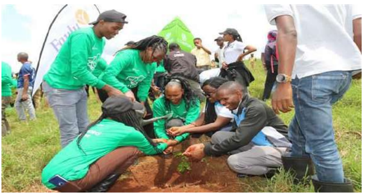
NYEWASCO Young Water Professionals engaging in a tree planting activity together with Faulu Old Mutual Foundation counterparts at Aberdare National Park

The "I am a Champion for Conservation" initiative, organized by Faulu Foundation and Old Mutual Foundation, aimed at curbing climate change through minimizing soil erosion and increasing water retention. The drive focused on promoting conservation efforts, with a particular emphasis on protecting the water catchment areas. This, in turn, would contribute to the fight against climate change and help create a sustainable future for all. The event brought together stakeholders from Kenya Forest Service, Tana Water Works Development Agency, Kenya Wildlife Service, National Environment Management Authority and other government institutions