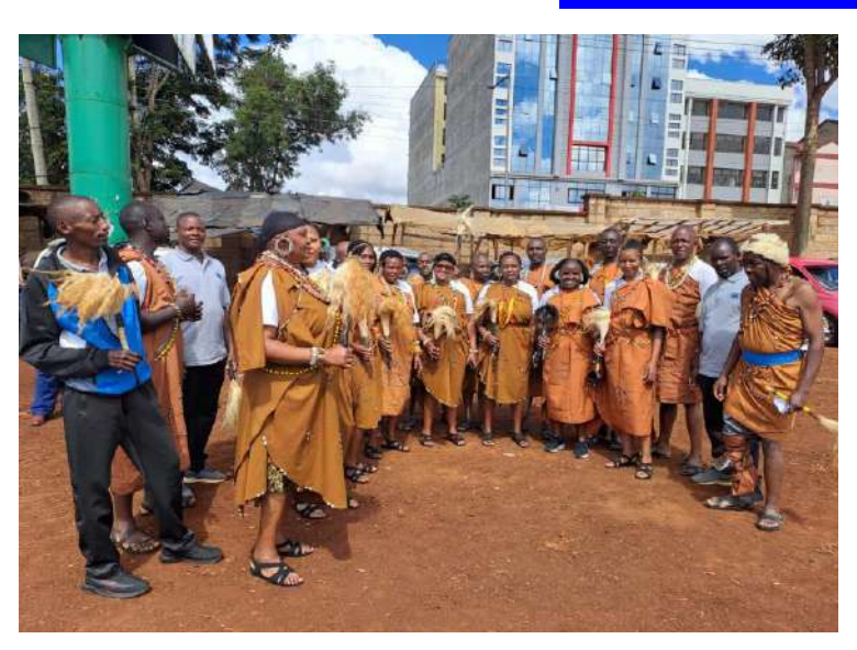
NYEWASCO Cultural Dance team pose for a photo during the celebrations

During the month, the Company Cultural Dance team enthusiastically participated in the Nyeri Madaraka Day celebrations, which were held at Kamukunji grounds in Nyeri Town. Their captivating performance left the audience in awe, as they showcased their exceptional expertise in singing and dancing.