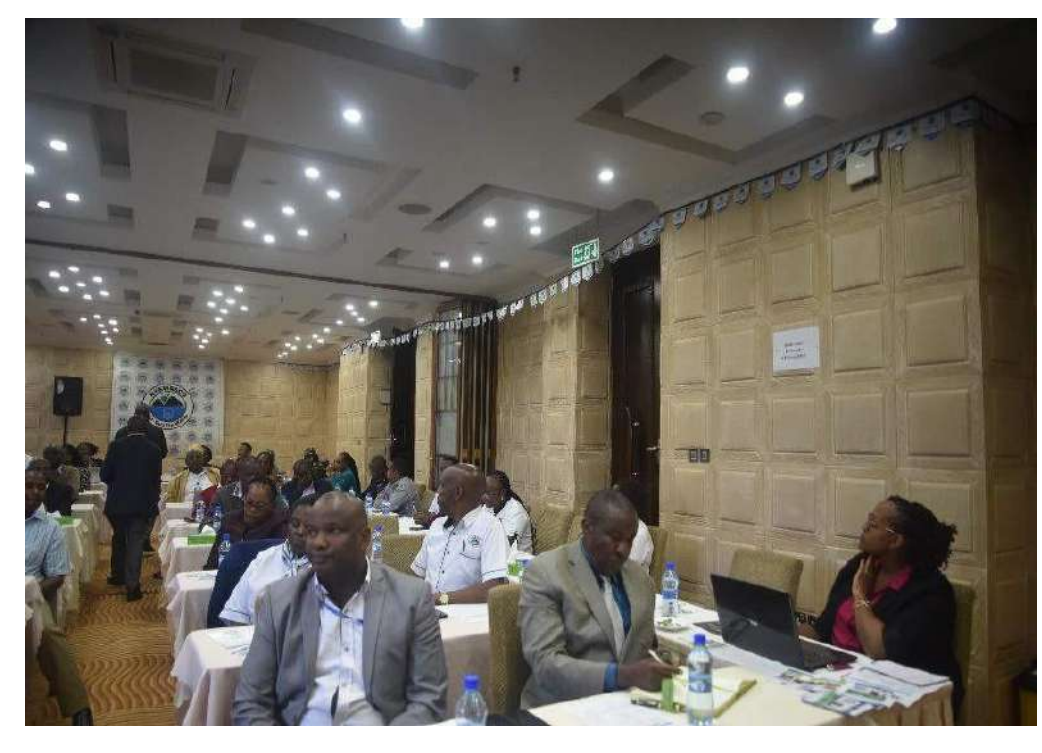
Left: A section of Stakeholders actively participating in a plenary session during the Stakeholder's meeting at White Rhino Hotel.