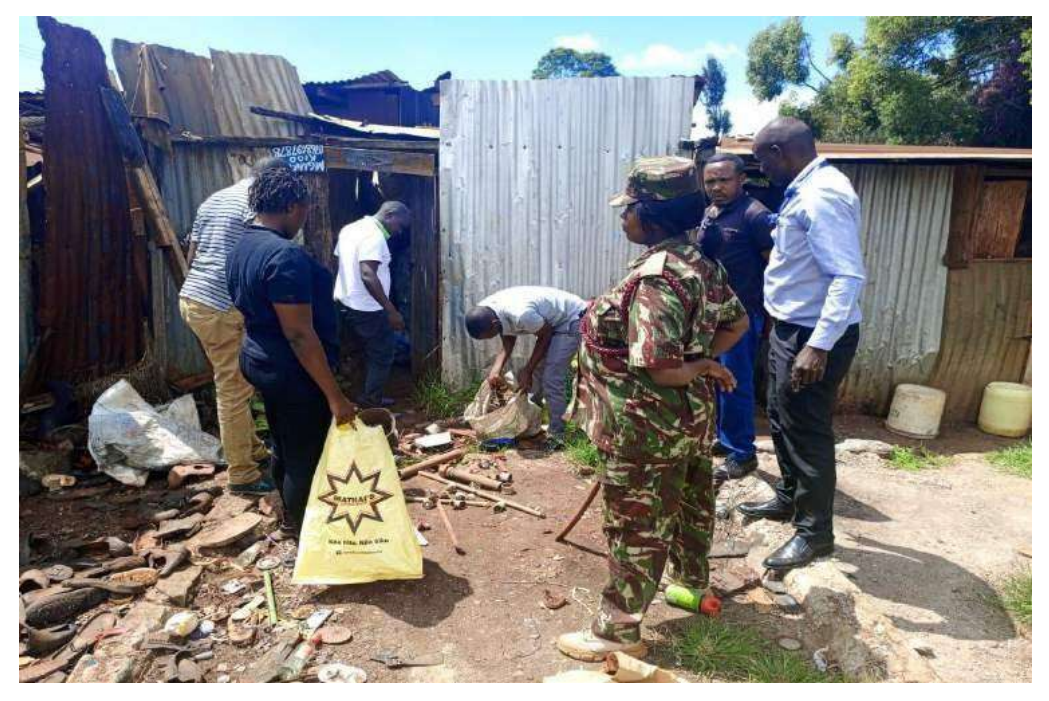
The two teams during a recent joint patrol in which metal dealers who are vandalizing the water networks were arrested.

The recently launched Water Police unit of police started its operations in Tana Region with its offices housed by the Tana Water Works Development Agency at their headquarters in Nyeri. This unit has been working closely with the Company's Security Investigations team to curb water theft and assist in debt collection.